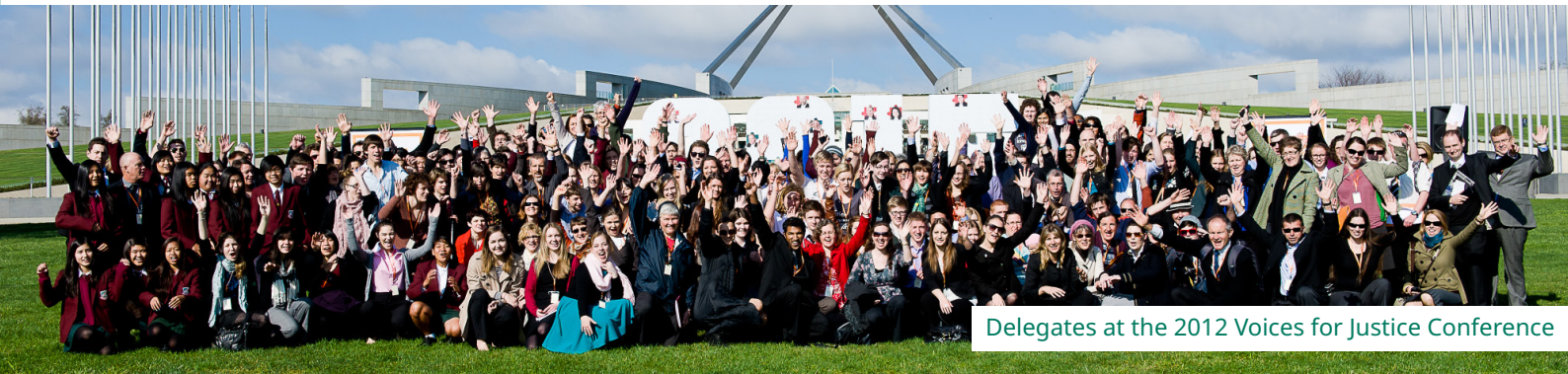
Delegates at the 2012 Voices for Justice Conference

Whenever we look at the world around us, we are bombarded with another slew of overwhelming headlines. We are tempted to turn away, to choose silence as a shortcut to apparent peace. But that is not an option that the most vulnerable can afford—or that our faith allows. Instead we are called to respond and engage, with compassion, intentionality and hope. We are called to speak.