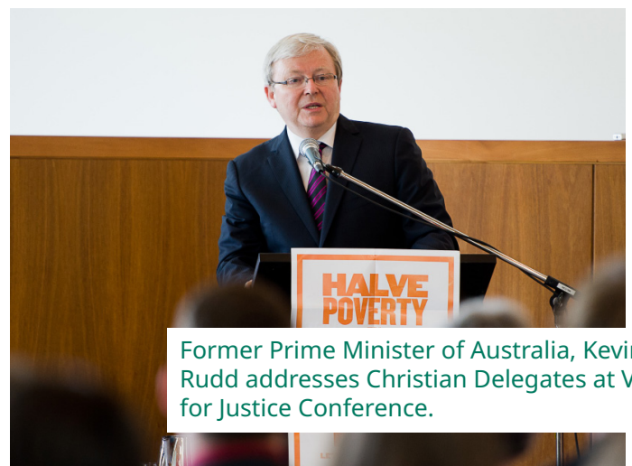
Former Prime Minister of Australia, Kevin Rudd addresses Christian Delegates at Voices for Justice Conference.

Effective advocacy is an art—or maybe it's a science—and there is much to learn for doing it well. This is one of the benefits of joining with an established group and working with experienced activists, as has been my experience in working with Micah Australia and ADRA in this way. But our first qualification is our voice, sparked by the compassion found in our faith and prepared to speak with and on behalf of those whose voices might not be heard in places of power and policy-making. When we speak up for the good of others, our voice is unique—and our witness faithful.